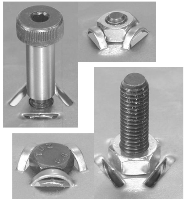
Fig 3: Mate HexLock™ retains DIN933 bolt which protrudes through the sheet metal for subsequent assembly.