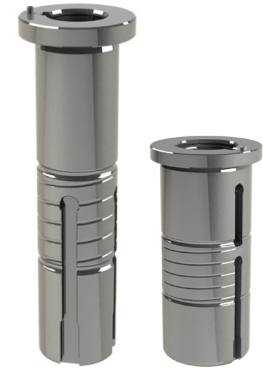
A & B-station stripper guides