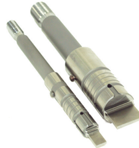
A & B-station punches